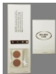
Rare-Earth Spot, North

Spot magnets are ideal for application “where it hurts.” Simply attach the spot magnet to the painful spot with the supplied adhesive plaster. They will normally stay on for up to 3 days, even through bath or shower and can be reused by changing the adhesive plaster. Discontinue use should skin irritation occur. We offer three styles of spot magnets as well as replacement plasters.